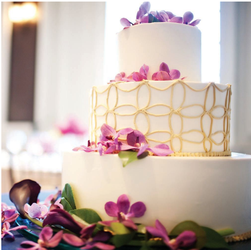
Berghoff pastry chef Chon Reynoso's artfully crafted layers of chocolate and yellow cake with vanilla crème brûlée filling.