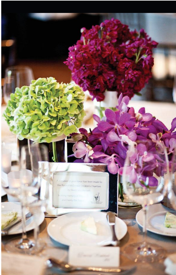
The tables were adorned with hydrangea and orchid centerpieces in shades of purple and green by Hello Darling.