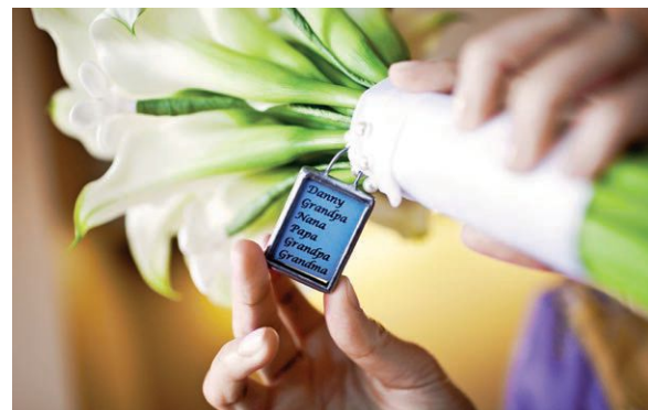
The bride's bouquet included a locket bearing names of loved ones lost.