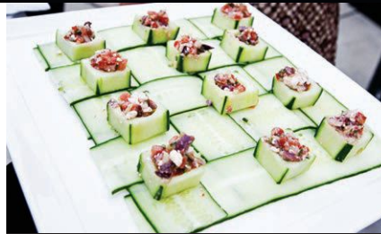
Salad bites in cucumber cups by Berghoff Catering.