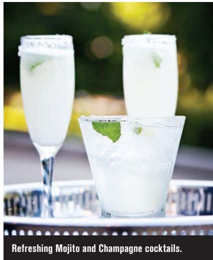
Refreshing Mojito and Champagne cocktails.